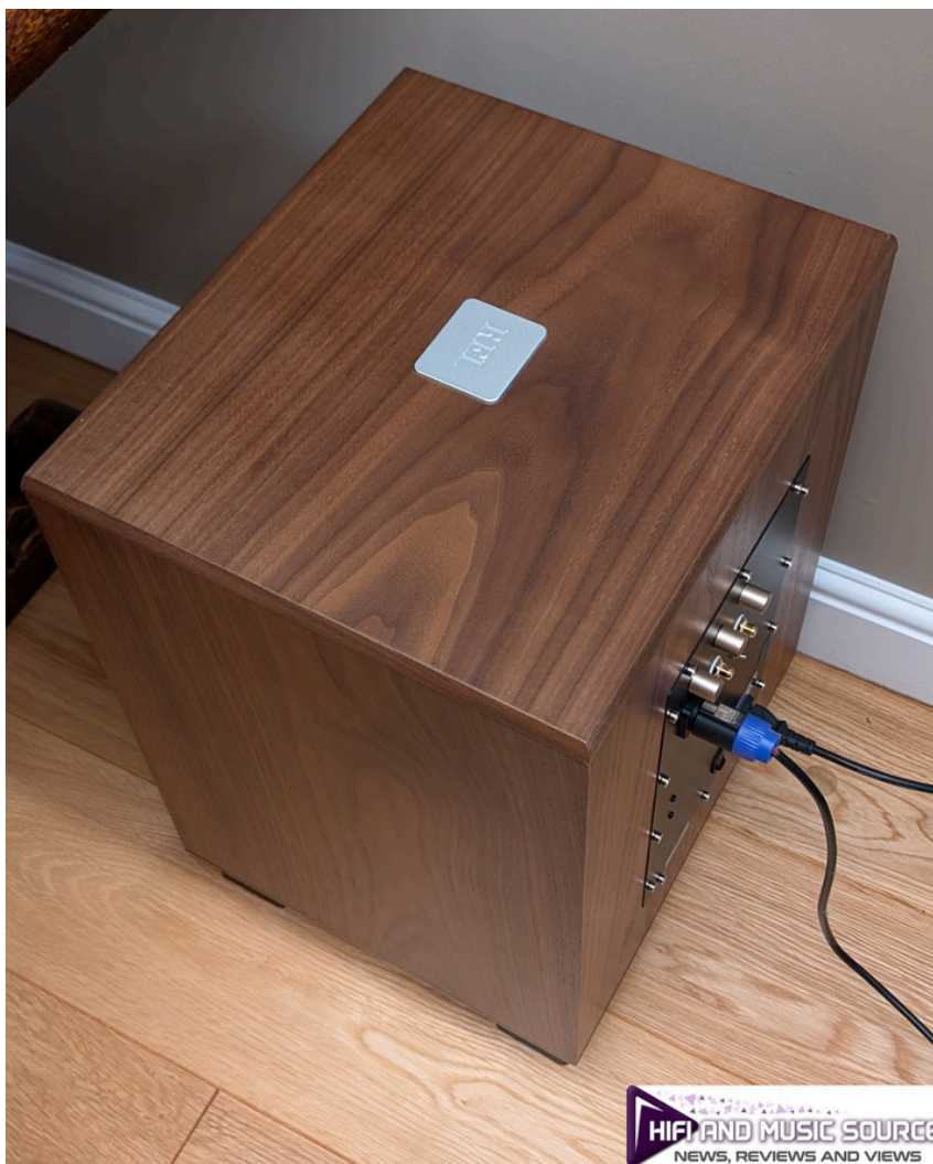
REL 99 Classic in Place

The 99 Classic is thus designed for larger rooms and, more importantly, to support larger speakers. The steel chassis, closed box, downward-firing design, and boundless power simplify the setup. The 99 can go wireless with REL's Airship II or HT-Air MkII wireless technology.