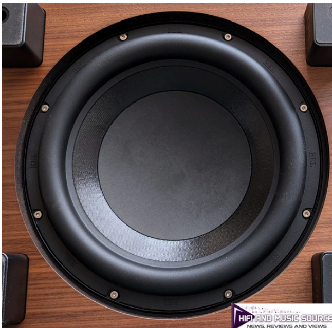
REL's 99 Classic 12" driver

The response from the 99 initially appears fast and musical; however, leaving it running for a day or so on a low level is a wise move. Now, I am no Kendrick Lamar devotee, but I do like some of his tracks for review purposes, and Humble (Skrillex Remix, which is very explicit, Qobuz 16-bit, 44.1kHz) is a challenging track with plenty of low-end response. With the bass-loading weight taken by the Classic 99, much of the musicality will be delivered by the Kudos Titan 505s. It is a musical journey and stunning to listen to. This is more than just a huge sound; the 99 Classic creates a space for the loudspeakers to work. Unplugging the 99 is a very dispiriting affair.